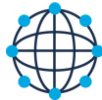
RAM Relationship Authorisation Manager